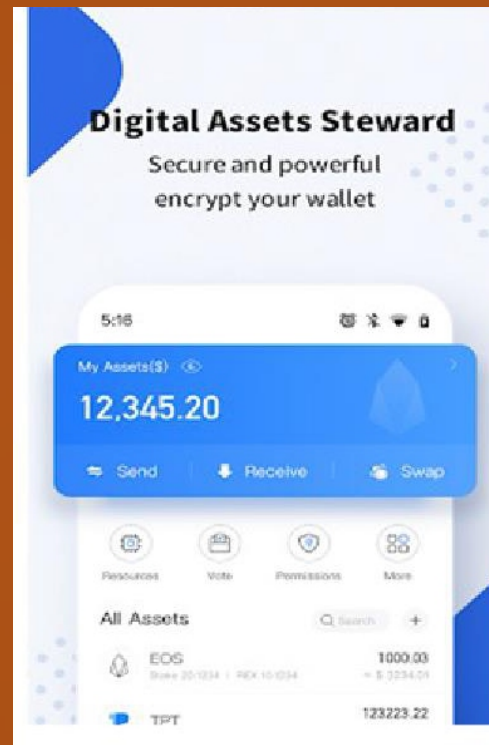
TOKEN POCKET WALLET