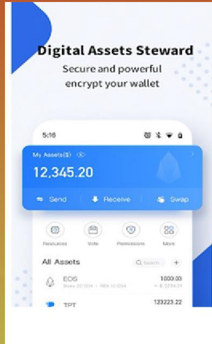
TOKEN POCKET WALLET